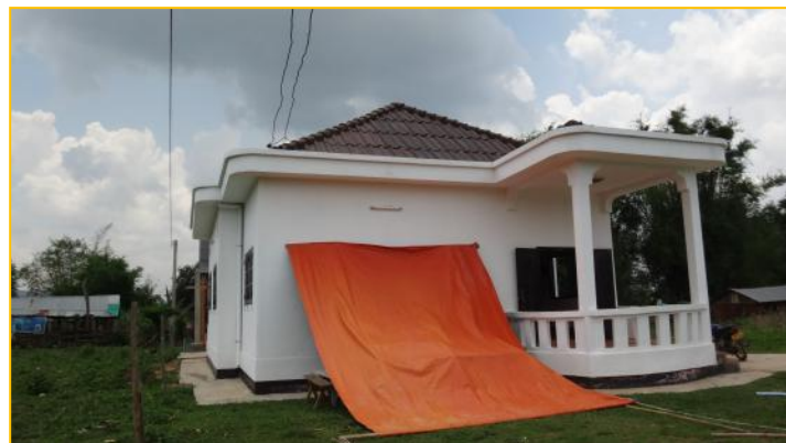
Dark clouds forming—our third classroom is in trouble

Our Xieng Khouang Language School has 3 classrooms: one in the living room, another in the kitchen, and the third is at the front of the house. But, the problem is that the rain is coming. In fact, it has already started raining in Xieng Khouang the day I arrived there, 28 April 2015. And more dark clouds were forming as evening approaches. How can kids study under the canvas sheet?