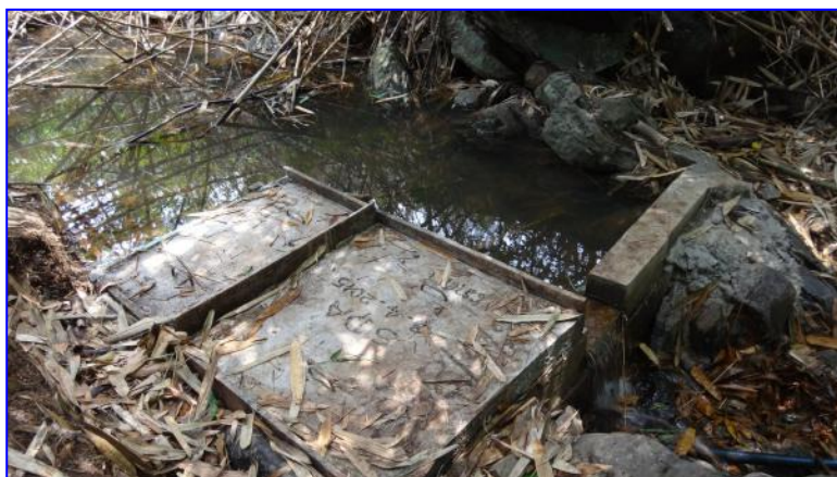
The filtering system and dam at the water source