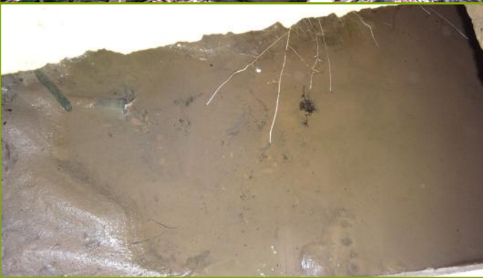
The water source filter tank has very little water left