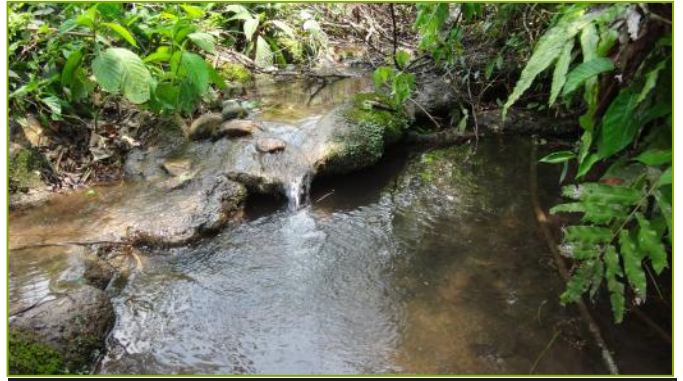
The new water source about 1 km from the vilalge

I used my watch to measure the height of the water source and it read 405 meters above sea level. Earlier, I measured the highest point of the village, where the existing Red Cross tank is located, it read 380 meters, and the lowest point where the dripping pipe was located it read 370 meters. This is possible to built a gravity fed water system if we use bigger pipe. I am confidant that it can be done because the Red Cross water source is just 5 meters higher than the new water source. This new source of water is also clean, so clean that local farmers are drinking from it by just sticking a split bamboo into it.