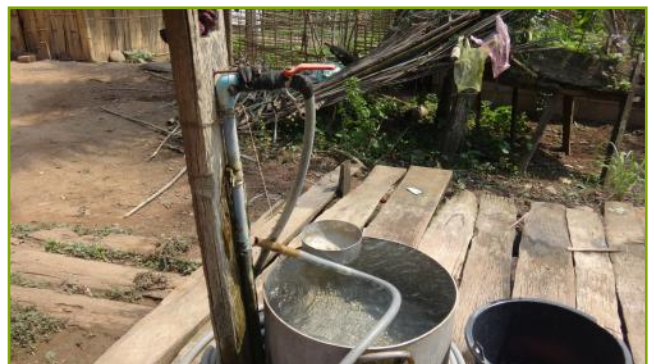
The outlet at the lowest point only gives a few drops of water

rent water system that they have. And surely, the water only drips a few drops per second. Not even enough for a bird or a chicken to drink. It takes all night to collect a bucket of water that you see below. That is barely enough for one household for a day.