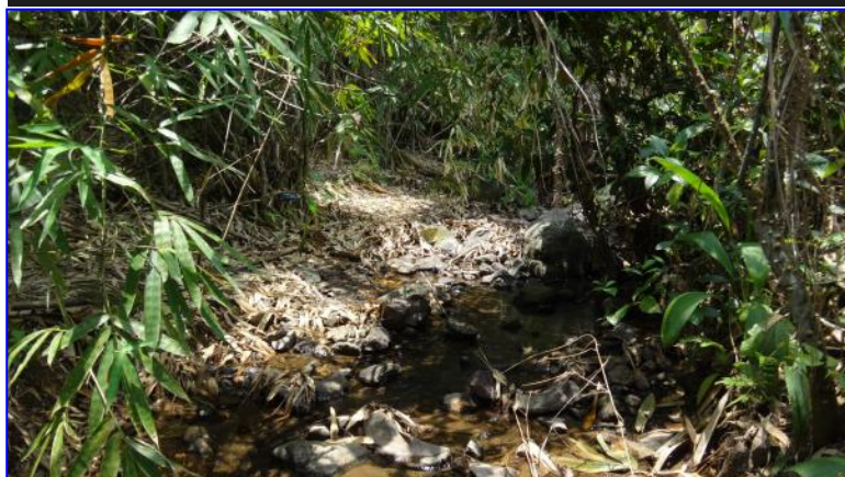
The jungle and stream at the water source