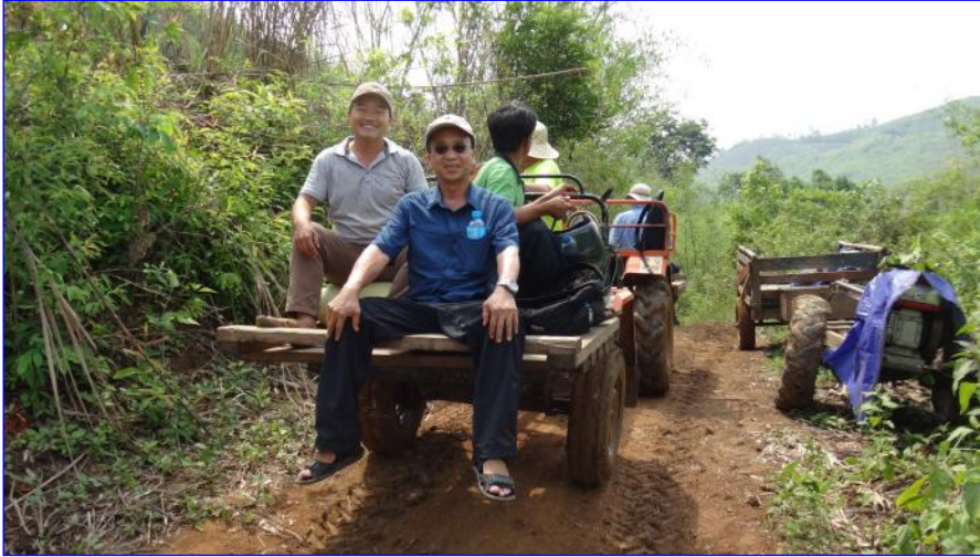
Our trip to Mok Jong on a Lao-made "Landcruiser"

Project Location: Mok Jong Village, Pak Ou District, Luang Prabang, Laos