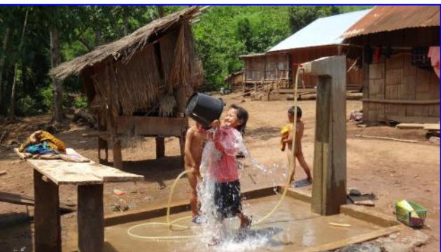
The third outlet of water in the village

When we came to the second outlet we found a lady washing her clothes there. When asked about how she felt about having water next to her doorsteps her face was beaming with joy and said it was really wonderful.