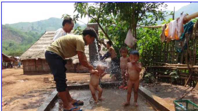
The fifth outlet of water in the village

As I came to the fourth outlet I saw a family, a father and his three little children, enjoy bathing at this outlet. I was so happy to see the people of this village using the water almost non-stop, one after another. Whereas before they hardly had a bath because of the scarcity of the clean water. Now, they can bathe at anytime and they really take the opportunity to clean themselves regularly.