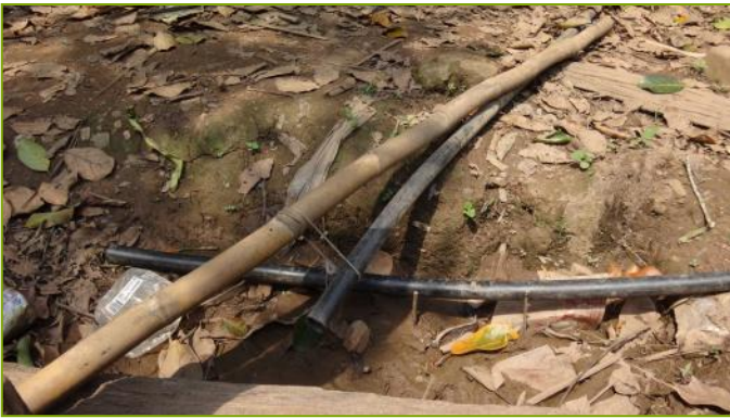
The higher point outlet is empty dried