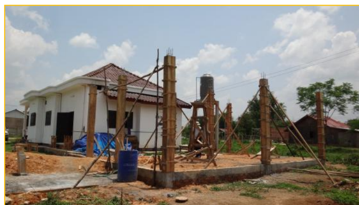
The foundation of the new two-storey school building

At first we planned to build a 2 classroom school just to temporarily accommodate the kitchen and third classrooms. But, the Lord has impressed us to build a 4 classroom school building instead. So, as our land is limited, our new school building will be 2 storey building with 4 classrooms.