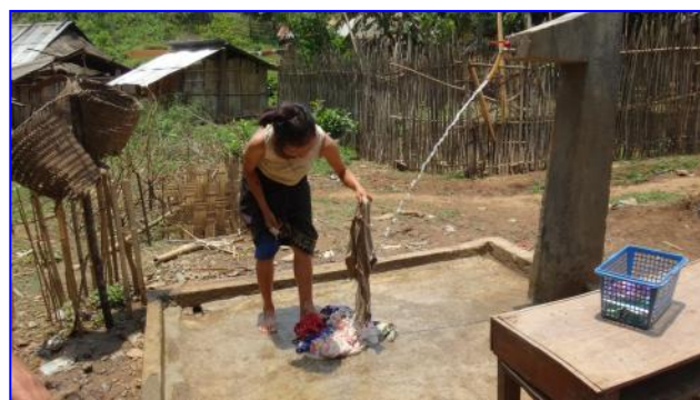
The second outlet of water in the village

When I tested the water flow it was very strong. There was plenty of pressure. So, one only needs to turn on the tap just half way is more than enough to have plenty of water flowing out.