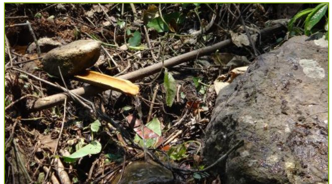
Local made bamboo water system

How long can 556 people survive without clean drinking water? Fortunately, the rainy season is coming soon. But, then, the problem is that the streams will be muddier and dirtier, making it dangerously unsuitable for drinking.