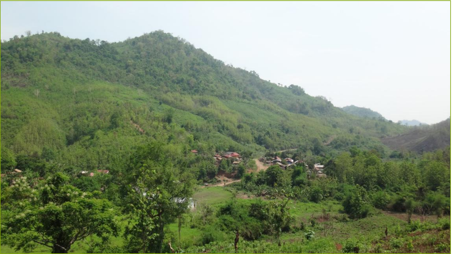
The Village of Na Ang, Chomphet District, Luang Prabang Province, Laos. Situated around 40 km south of Luang Prabang City.

Na Ang Village is situated south of Luang Prabang on the other side of the Mekong River opposite the city of Luang Prabang. To go there one has to cross the Mekong by a ferry and take a local utility vehicle on a dusty road going southward towards Sayabouri Province, cross a few rivers, climb a few mountains, and finally will arrive at Na Ang Village which situated at the foot of a mountain, surrounded by many mountains.