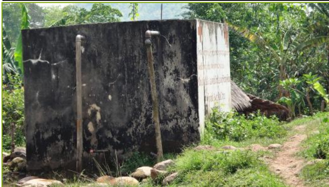
The water tank built by Swiss Red Cross

I used my watch to measure the height of the water source and it read 405 meters above sea level. Earlier, I measured the highest point of the village, where the existing Red Cross tank is located, it read 380 meters, and the lowest point where the dripping pipe was located it read 370 meters. This is possible to built a gravity fed water system if we use bigger pipe. I am confidant that it can be done because the Red Cross water source is just 5 meters higher than the new water source. This new source of water is also clean, so clean that local farmers are drinking from it by just sticking a split bamboo into it.