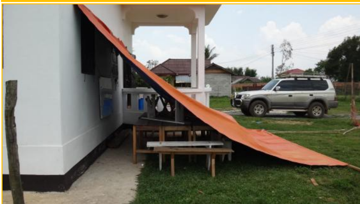
The current third classroom of our school in Xieng Khouang

Our Xieng Khouang Language School has 3 classrooms: one in the living room, another in the kitchen, and the third is at the front of the house. But, the problem is that the rain is coming. In fact, it has already started raining in Xieng Khouang the day I arrived there, 28 April 2015. And more dark clouds were forming as evening approaches. How can kids study under the canvas sheet?