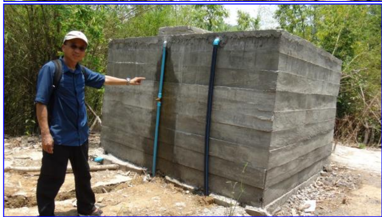
The water tank just above the village

The water tank above the village is large, but the water is still overflowing at the time of my visit which was in the driest month of the year. And that was during the daytime and the people were using the water constantly.