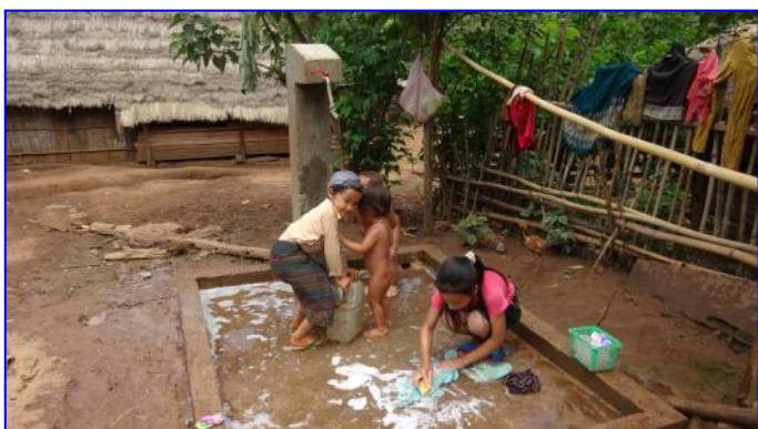
Children washing clothes and bathing

But, it was the fifth outlet that took the most interest of the people. I was sitting near there and observing people coming to use the water. And it was almost never vacant. One after another came to use the water. I first saw children come out of their homes to wash their clothes and bathe (as below) while other children enjoyed playing with the water.