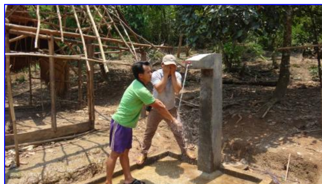
The first outlet of water in the village just below the tank

The water tank above the village is large, but the water is still overflowing at the time of my visit which was in the driest month of the year. And that was during the daytime and the people were using the water constantly.