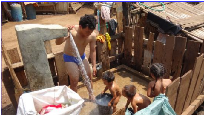
The fourth outlet of water is located in the middle of the village

body. It was good to see children enjoy using the water.