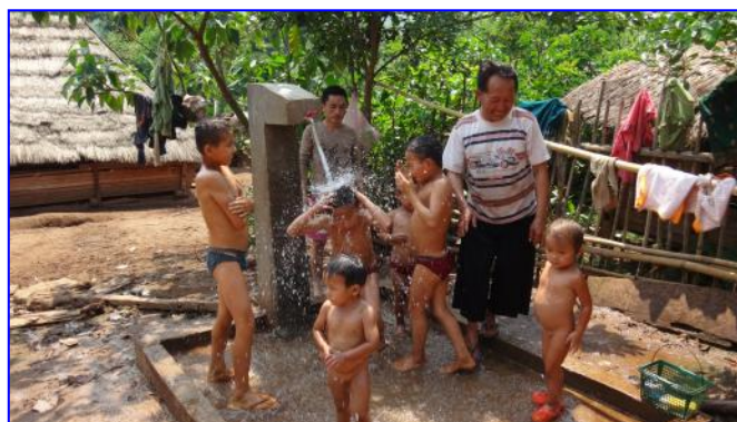
Children enjoy bathing at the fifth outlet

So, all five water outlets in the village have plenty of water, more than enough, for villagers to use all five of them at the same time! We also provided underground pipe for used water to flow away cleanly. This means that the soil around the water outlets will remain dry and clean.