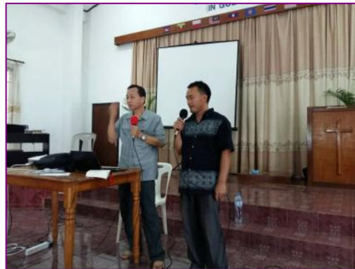
Training translated from Lao to Hmong dialect

The next two years, LAF will try to raise funds to contribute to the costs of the new multipurpose church building. LAF needs $80,000 in total. It has started raising funds from its total membership of 1,300, most of whom live under poverty line of $1.25 per day. Nevertheless, it is quietly confident that God will provide sufficient funds to complete His multipurpose church building in Laos. This is the historic church building in Laos which will be recorded in the history of the Laos church. If you feel that you would like to part of the history of the Laos church please let us know. We will provide the information how you can send funds to us.