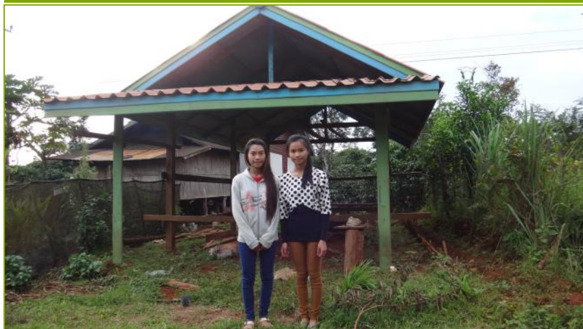
Standing with her younger sister in front of their unfinished shop-house