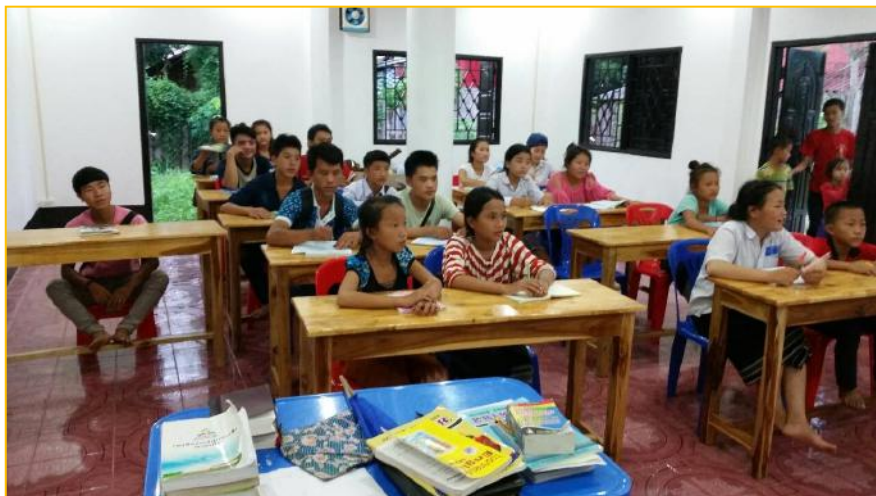
Over 20 students crowd in to study English at Luang Prabang English Center

portantly, I forgot that once we purchased the house we still needed to renovate it to make it usable. And even I have forgotten about the extra costs of renovation and water system the Master already had in mind what we needed to do. So, instead of giving $45,000 God gave through you the total of $59,193.44. With the extra funds you gave we were able to renovate the house, dug a deep well, installed a water system, and equipped the house with tables and benches for the language school. To you all who have given to the purchase of this property, thank you very much. You have partnered with the Master in the Business of saving souls. Now you can see how the business of saving souls starts. I will give you the breakdowns of expenses on the project once everything is finalized. There are still many things to do to get our property to be presentable. We still need to do the fence/wall around the property. Then, we need to do a parking space for motorbikes, bicycles, and cars. We will need to do up, concrete or tar seal, the access road, which is around 200 meters from the main road. We will need to put up shelters for our students during the rain while waiting for class to begin and during recess.