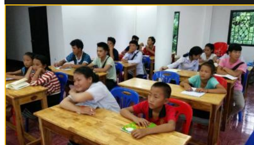
The lucky ones are inside enjoying every moment

There is no time to waste. We cannot just sit and wait for teachers to spring up like mushrooms. We need to purposely train them and train them fast. We have young people who completed their high school certificate in Laos, but we do not have funds to send them to study English at Asia-Pacific International University (AIU) because of the ESL barrier. Please pray for us, asking God to remove this superficial ESL mountain, so Lao students can be prepared for the service of the Master. Unlike other missions Lao Field does not have an English school to prepare our young people for AIU.