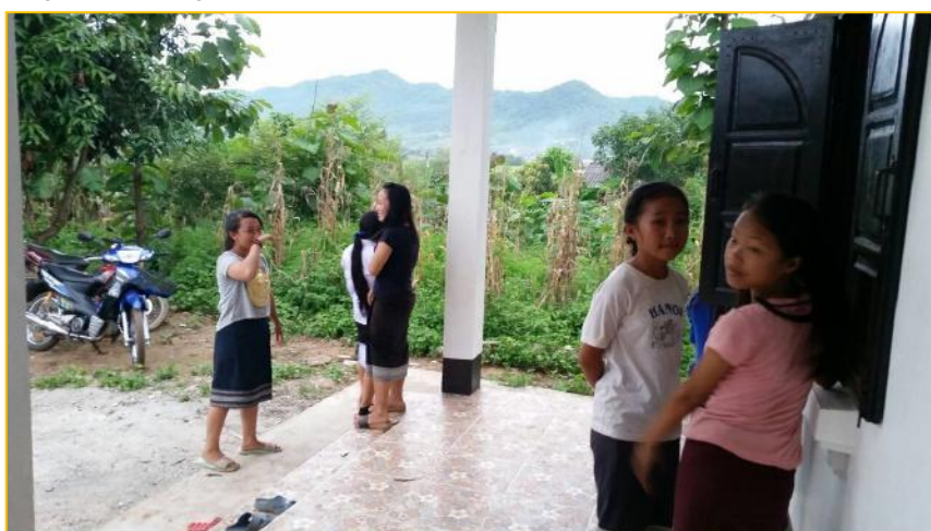
Students waiting for the next class are standing outside

portantly, I forgot that once we purchased the house we still needed to renovate it to make it usable. And even I have forgotten about the extra costs of renovation and water system the Master already had in mind what we needed to do. So, instead of giving $45,000 God gave through you the total of $59,193.44. With the extra funds you gave we were able to renovate the house, dug a deep well, installed a water system, and equipped the house with tables and benches for the language school. To you all who have given to the purchase of this property, thank you very much. You have partnered with the Master in the Business of saving souls. Now you can see how the business of saving souls starts. I will give you the breakdowns of expenses on the project once everything is finalized. There are still many things to do to get our property to be presentable. We still need to do the fence/wall around the property. Then, we need to do a parking space for motorbikes, bicycles, and cars. We will need to do up, concrete or tar seal, the access road, which is around 200 meters from the main road. We will need to put up shelters for our students during the rain while waiting for class to begin and during recess.