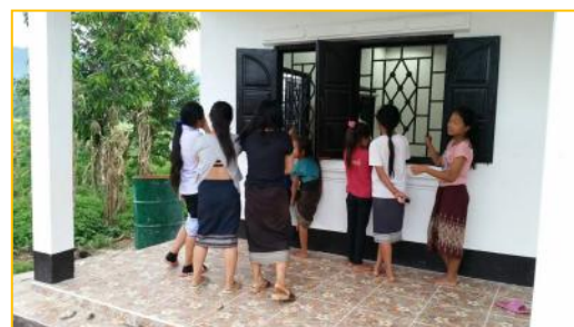
Students peeping to learn English from outside

The way to go is to recruit Lao Adventist English teachers. And we need many of them real soon. In Xieng Khouang Province, our first English Language Center that was opened in 2014, has more than 150 students already. The students are more than two teachers can handle. We need to add more teachers to that school too. Now, Luang Prabang English Language School has started. We will need more teachers for this school real soon. We will start an English Language School at our new rented office in Vientiane too. We will need English teachers for that school as well. What shall we do? Why are we creating all these problems for ourselves? We might think, "if we do not have teachers then don't start a language school. No school no problem, right?" But, the Lord keeps talking to me to "work while it is day, night is coming, when no one can work" (John 9:4).