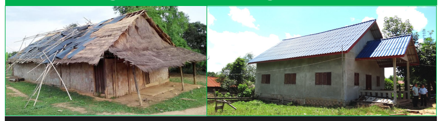
Thongnamee Church, Borikhamxay Province, Central Laos—Past and Present

It is not hard to imagine how life in the old and new Thongnamee church would be like. Once dirt floor and turned muddy when it rained, not concrete floor and no dripping rains onto your heads. But, it is not just the church building that is breathing new life the children are also giving new hope to the future of this church.