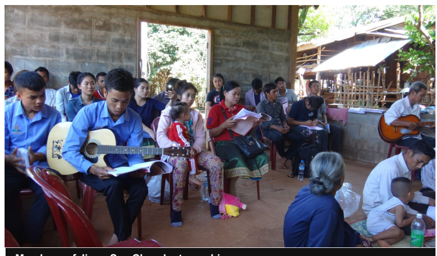
Members of Jiang Say Church at worship

If the unfinished church building could attract people to Jesus how much more the decent church building could do? The church building may look unattractive but the members of this church and leaders are caring and loving. This is what keeps people interested in coming to this church.