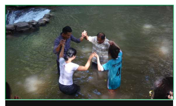
Praying before baptism at a waterfall

Please remember praying for the Jiang Say church construction. This is the only church that has received a written permission to build from the local authority. Here we have been given freedom to worship and practise our religion. As you can see, we could even held a baptism in full sight of tourists who were playing at the waterfalls.