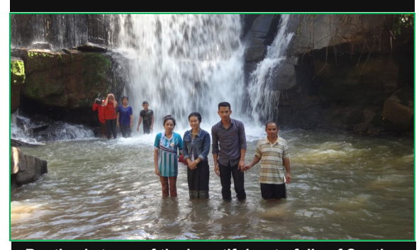
Baptized at one of the beautiful waterfalls of Southern Laos

More importantly, this church serves as the Southern base for our One-Year-In-Mission (OYIM) phase 5. Our young people will stay here at this church and work in this area. They will spread the seed of the gospel in this area in the next 6 months. Please pray that through their work many more people will be added to the Kingdom of God and join the Jian Say church.