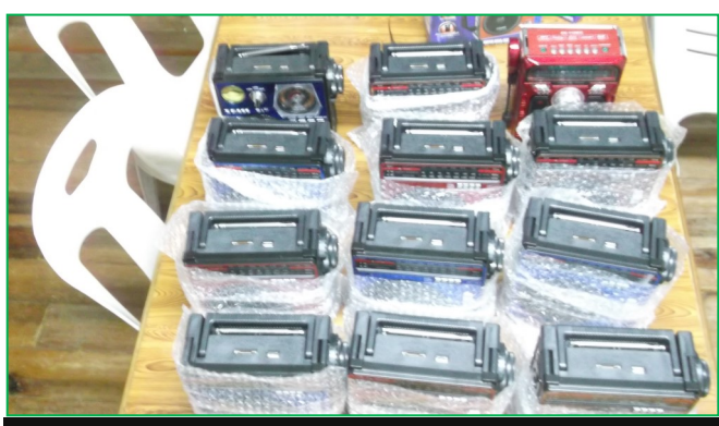
The twelve "apostles" who are going to take the gospel to every corner of Laos

An MP3 device like the ones above fitted with SD cards costs around US$35 each. Consider what it can do I think it is not expensive at all to spend $35 for an 'MP3 preacher' that can preach anytime and anywhere without getting tired. Besides, you don't have to worry about giving stipends to this preacher. All you need to do is to sponsor the initial $35 for this non -human preacher and it will do the job again and again without getting tired. Just imagine how many people it can preach to and there is no limit to where it can go. I think it is a great way to share the gospel message by having a nonhuman 'preacher' to work on our behalf. This preacher never gets tired, doesn't need to be fed, and can go where we cannot. Most importantly it is working and effective.