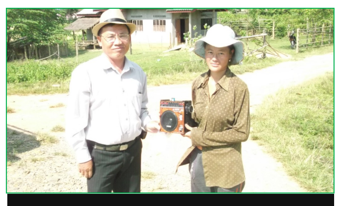
Another woman who is glad to receive the MP3 device

car when we travel around to visit members.