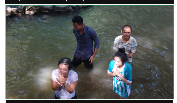
The joy of being saved and becoming God's children