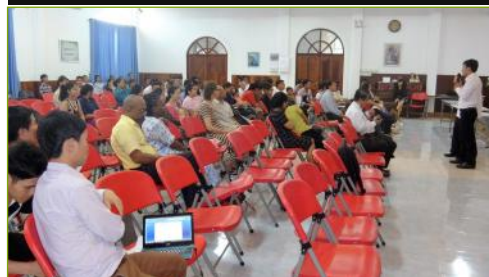
Vientiane church members enjoy bible conference in the afternoon of 23 April 2016

It was really an eye opening to many people to hear about the shame and honor in different cultures. The ultimate shame though is sin. To cover this shame God had to kill a lamb and covered the shame for Adam and Eve. God has now made available through Jesus a garment to cover our shame. Do you need one? Let us know if you need one.