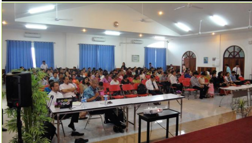
Sabbath Worship during the Bible Conference in a rented place, Vientiane, Laos