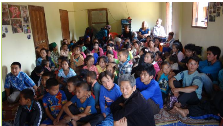
"No more room to squish in anymore" - Nam Thouam House Church as of March 2015

May God bless you as you live your lives for Him, in expectation of His Soon Return, each day.