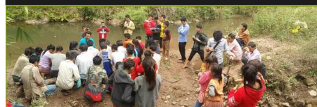
Recent baptism of 23 people, more to come soon