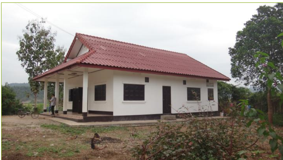
Luang Prabang Church Property as of February 2016