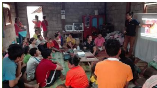
People are so eager to learn through the night

"Why no one told us about how to live a healthy life before?" Well, doctors cannot tell people to do what they themselves cannot do. Once Mahatma Gandhi was asked to by a concerned mother to tell her daughter to stop eating sweet candies. He told her to come back with her daughter in two weeks' time. After two weeks, the mother brought back her daughter to him again. This time, Mahatma Gandhi called the girl to him and told her to stop eating sweet candies. The mother was puzzled and she asked why Mahatma Gandhi did not tell her daughter to stop eating sweet candies two weeks ago when she requested him to then. Mahatma Gandhi smiled and answered the concerned mother, "You see, two weeks ago when you asked me to tell your daughter to stop eating sweet candies, I also ate sweet candies too. I could not tell your daughter to stop eating candies when I myself still ate candies. Now, that I have stopped eating candies I can tell your daughter to stop eating candies too."