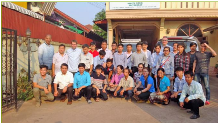
Pastors and Church Leaders in Laos at recent Bible Conference, 22-23 April 2016