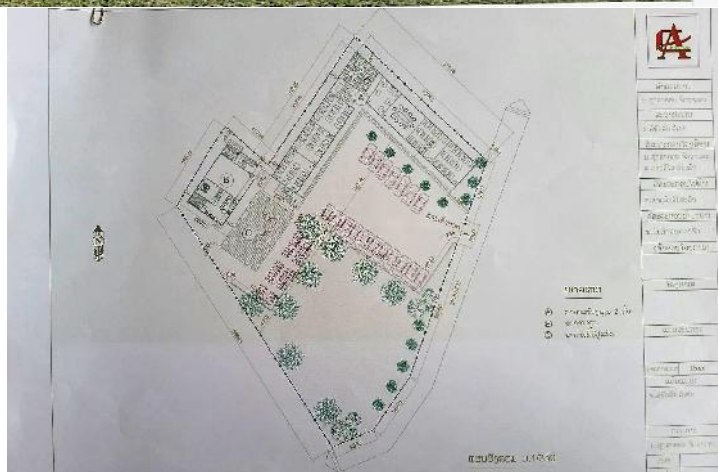
The master plan for Namthip Savanh Language School, Luang Prabang

The first school building (B in the Master Plan) will be constructed first for the cost of $51,500. So far, we have received $17,500 and have started building it already. The students' toilet facility and water tower are part of the first phase of construction.