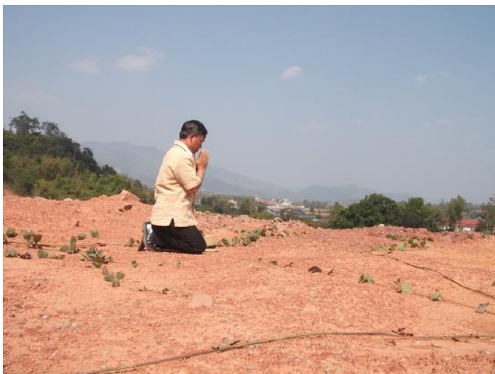
The Pastor prays over the City of Oudomxay

and did not know where to start and what to do next. The pastor asked me for advice. I did not know what to do either, except praying for wisdom. So, I told him to start a prayer walk and ask the Lord to show him what to do. That was what he did. He walked around the city parameters and knelt down on a hill overlooking the city and prayed.