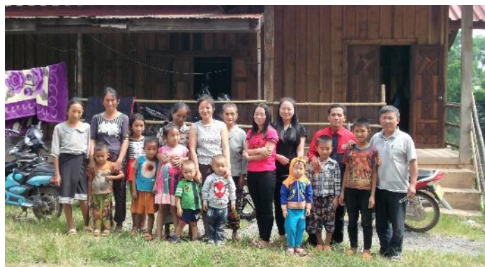
Church members in Oudomxay who meet at the pastor's house

The news about what Jesus did for the widow of Oudomxay spread far and wide. Many more people came to the pastor for help and healing. In subsequent months several people came and received healing for their physical ailments and also many have embraced the gospel message and accepted Jesus as their personal Saviour. Recently, two more families also came to the pastor asking to join the church in Oudomxay (see full story in the next page).