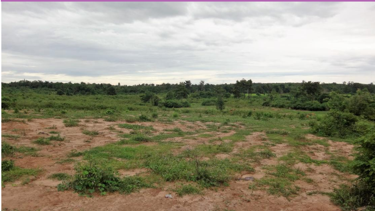
Land for the first Lao Adventist Academy is in the process of being purchased

Lao Attached Field (LAF) is in the process of purchasing this piece of land, total area 24 plus hectares or almost 100 acres, at the foot of the Phou Khao Khwai Biodiversity National Park, 60 km from Vientiane Capital. It is surrounded by waters such as big pond, creeks, and waterfalls. Nowhere is as tranquil and solitude as this place.