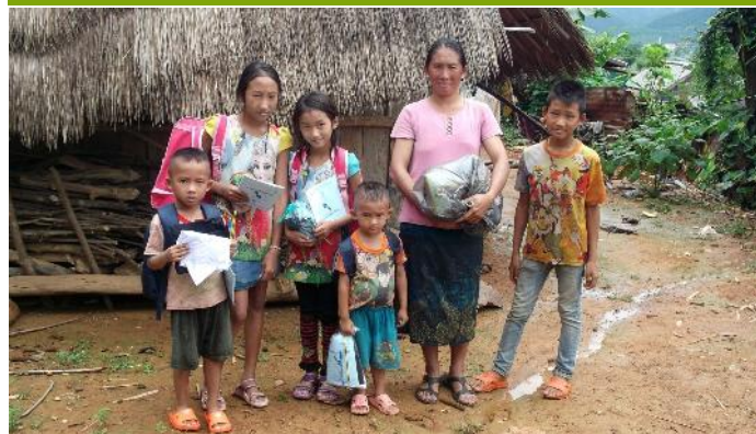
The woman and her five children back in their house

and the words of God. After several bible studies the woman and her two teenage children were baptized into the Lord.