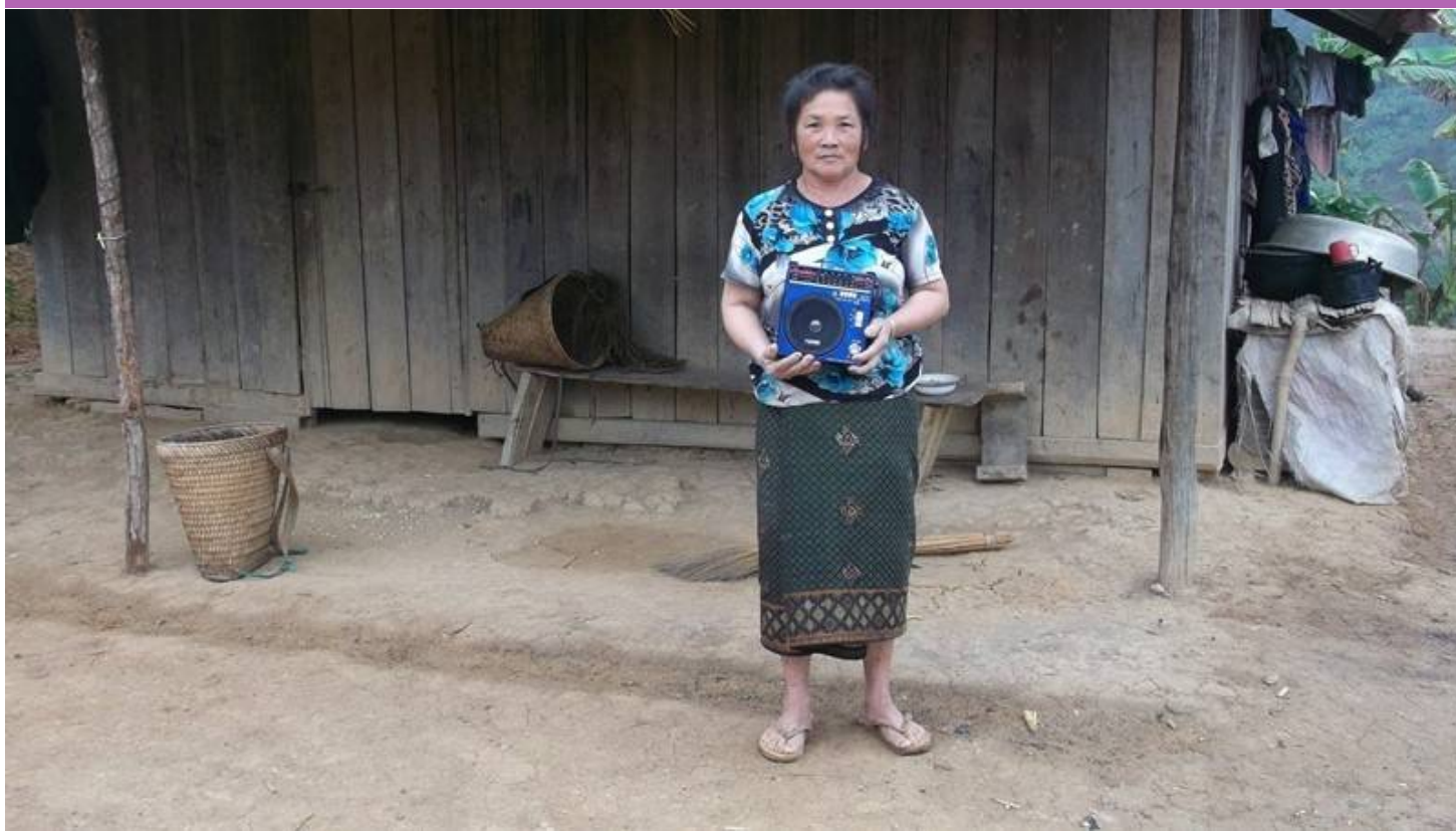
This woman took an MP3 device home and now her husband wants to become Christian too

Earlier in the year 2016 a couple of women came into contact with our pastor in Oudomxay. They had known about what happened to the widow and so they came to see the pastor because they also had health problems. They were healed and ready to go home. So, the pastor gave them each an MP3 device to take home with them. In that radio contains an SD card full of sermons, bible studies, hymns, and praise songs.