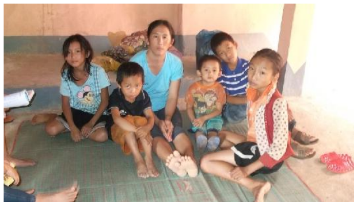
The woman and her five children at the pastor's house

She was finally unchained by the village chief and they brought clothes for her to wear. But, people were still afraid that the demons could return and possess her again. So, she and her five children had to move into staying with the pastor's family for a couple of weeks where they were given the love of God