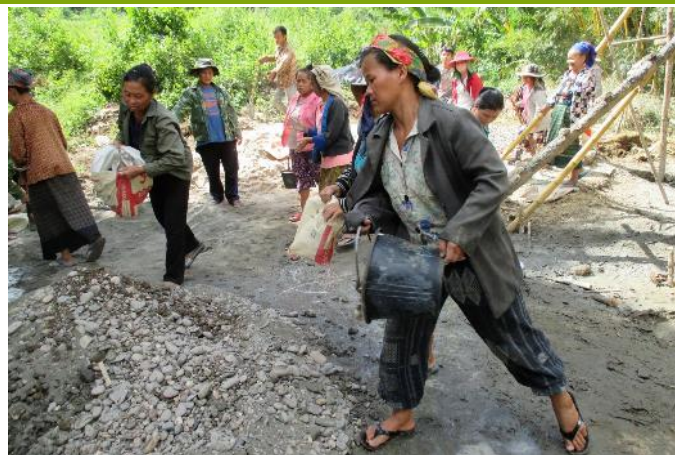
Adventists and Non-Adventists are working side-by-side

Water supply is one of the many good projects that the Lao Adventist Church is undertaking to improve the quality of life of the Lao people. We also provide mosquito nets and blankets to those needy people to prevent them from being bitten by mosquitos and get sick. Blankets keep them warm during winter and thus making the people healthier and happier.