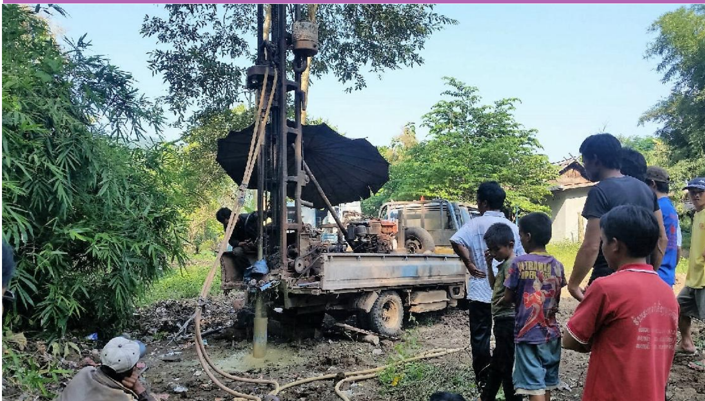
Heavy machinery drilling a deep borehole to provide clean water for the people of Na Ouan Village, Luang Prabang

It is hard to imagine that, in 2012, our pastor was once arrested at this village. Today, the people of Na Ouan Village gladly welcome the presence of the Seventh-day Adventist. A water project, funded by Adventist Southeast Asia Projects (ASAP) has changed the perception and attitude of the people of this village. Taking Jesus' method seriously, the Lao Adventist Church has been working hard to build good relationship with the authority of this village since the arrest in 2012. Seeing their need for water we offered to help. To their amazement the authority sincerely welcomes our gesture of goodwill.