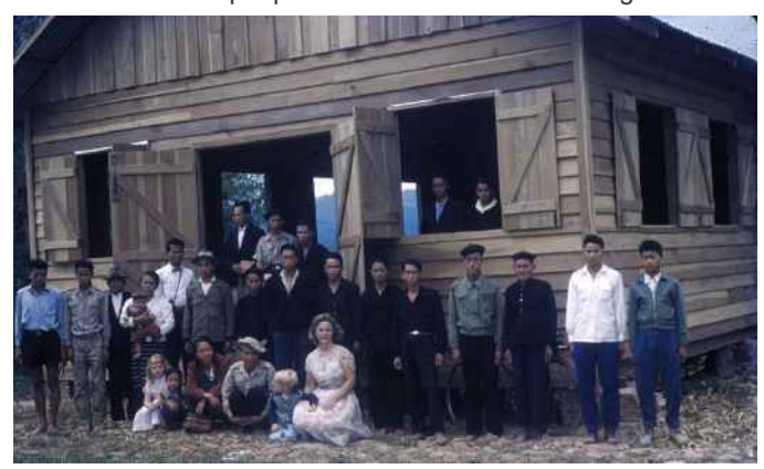
This is the church that the Halls built in 1960. Unfortunately, it was later destroyed in the war. The young-in-faith members were scattered after their shepherds had left. Some resettled near the border of Thailand and later built a church in Nam Yawn Village, near Houay Say City in 1969.