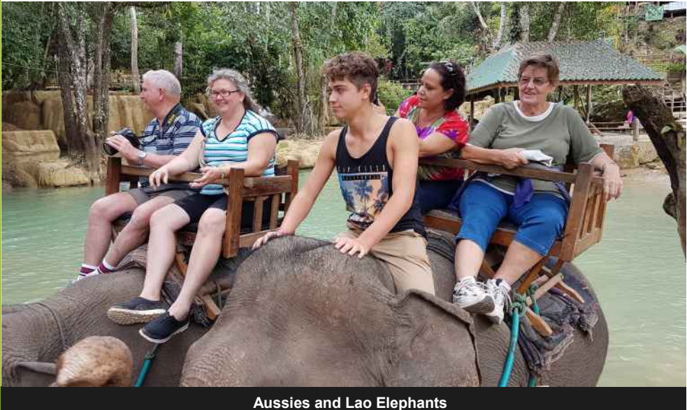
Aussies and Lao Liephants

In additions, they also have been helping with evangelistic materials, the needy, and other things. Thank you all of you for your love towards the Lao people.