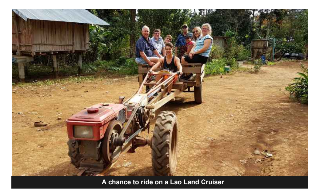
After visiting the first Adventist Church in Laos, they traveled on to visit another church in northern Laos and had a chance to ride on a Lao Land Cruiser.